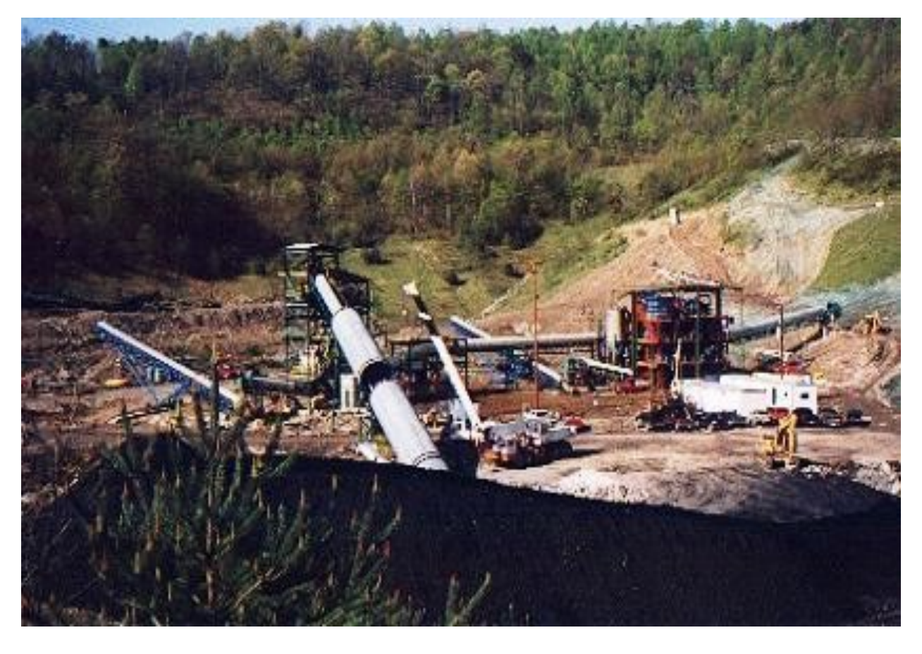
PREP PLANT B SIDE- KANAWHA COUNTY, WV