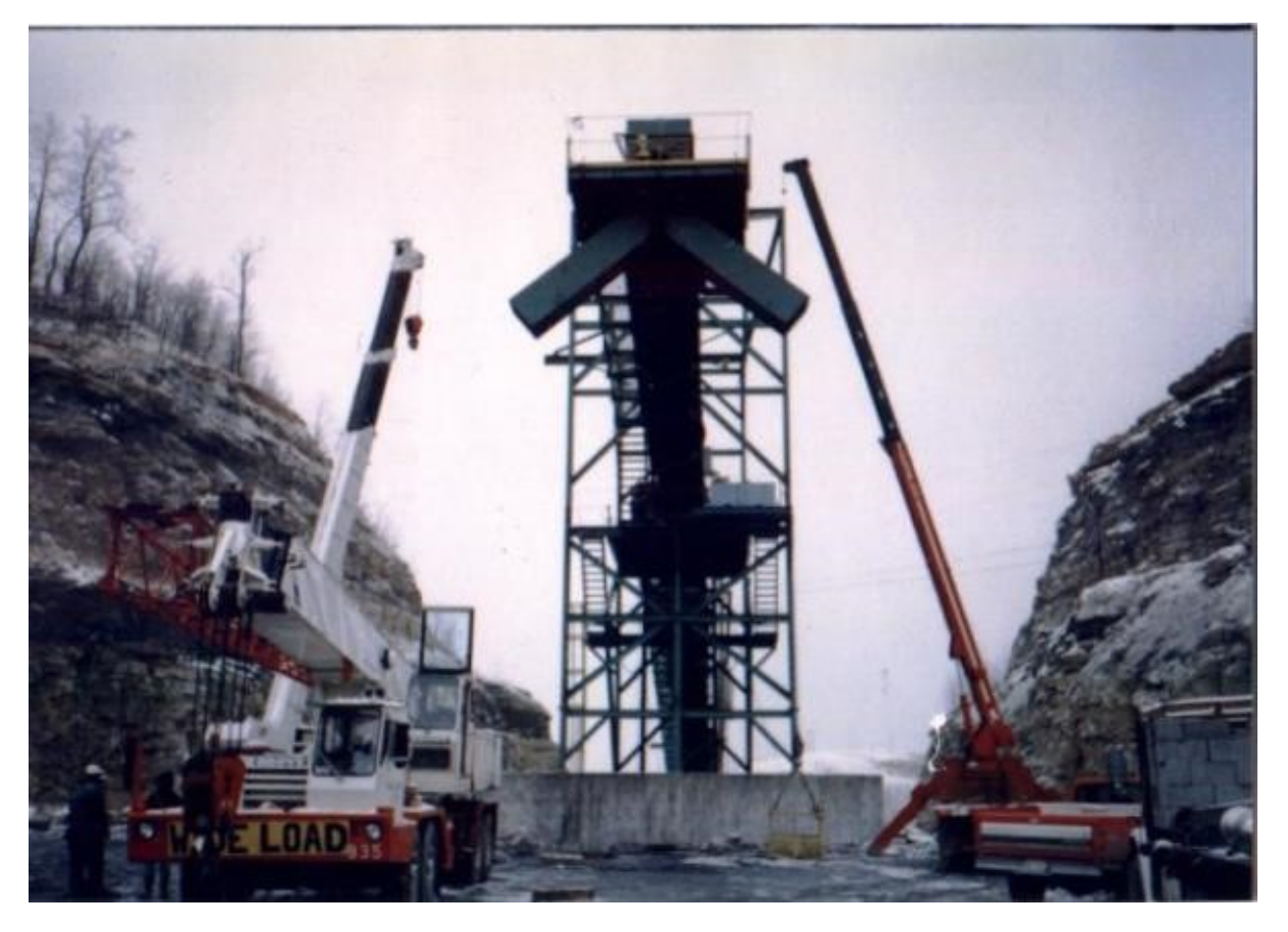
RAW COAL STOCKPILE CONVEYOR-SIDE VIEW