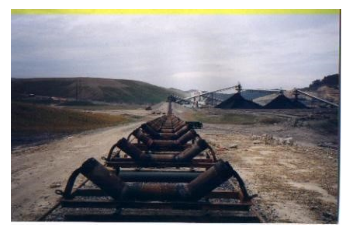
48" OVERLAND CONVEYOR WITH HOOPS